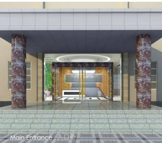
Main Entrance . 入口处