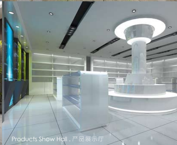
Products Show Hall . 产品展示厅