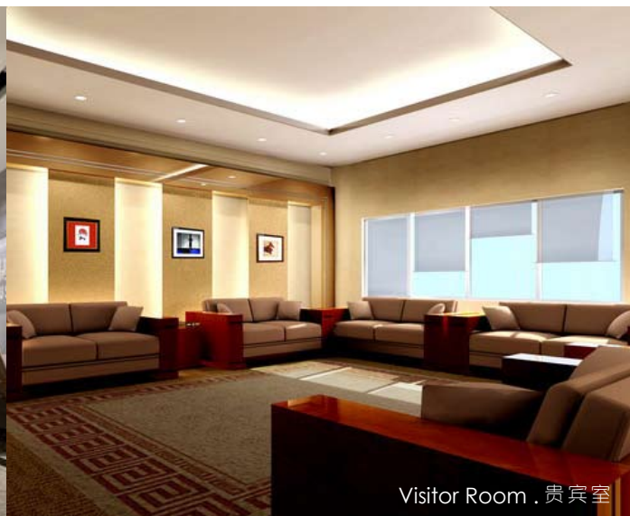
Visitor Room . 贵宾室