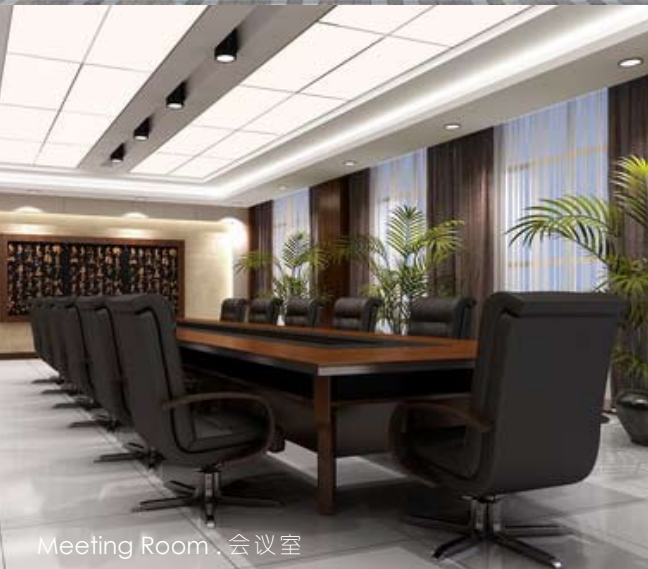
Meeting Room . 会议室