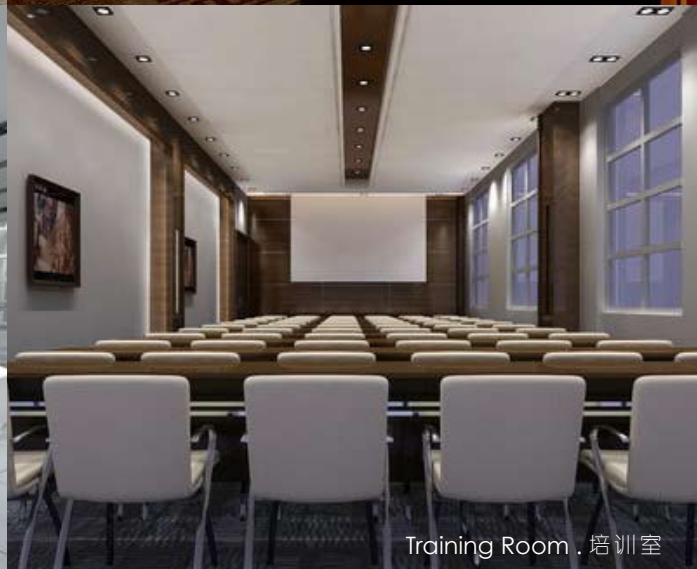
Training Room . 培训室