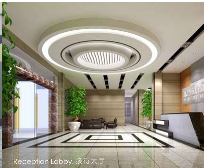
Reception Lobby . 接待大厅